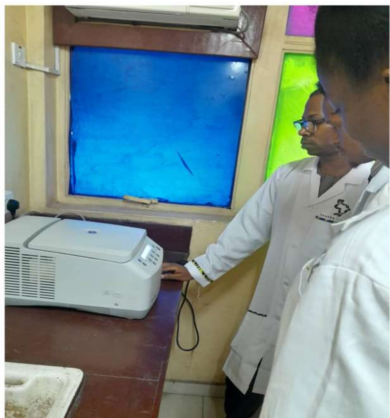
Eppendorf Microcentrifuge (Refrigerated) Model: 5425R, refrigerated, 230V/50-60Hz