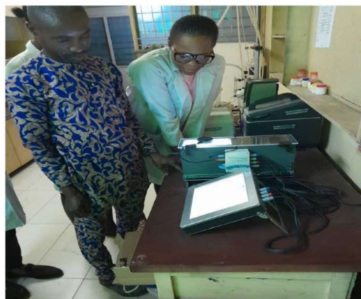
Passive Avoidance Step-through